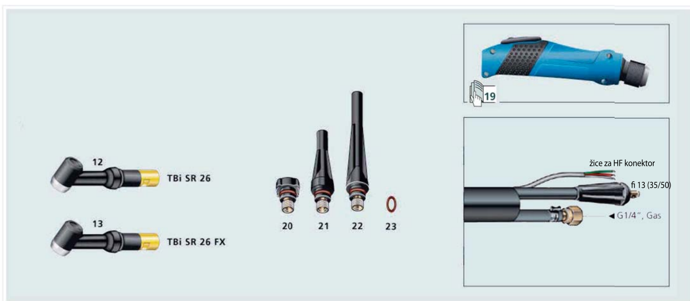
TBi SR 26

TBi SR 26 (FX) luftgekühlt / air cooled / refroidissement par air 60% (10 min.) AC: 170 A DC: 240 A Ø 0.5-4.0 mm