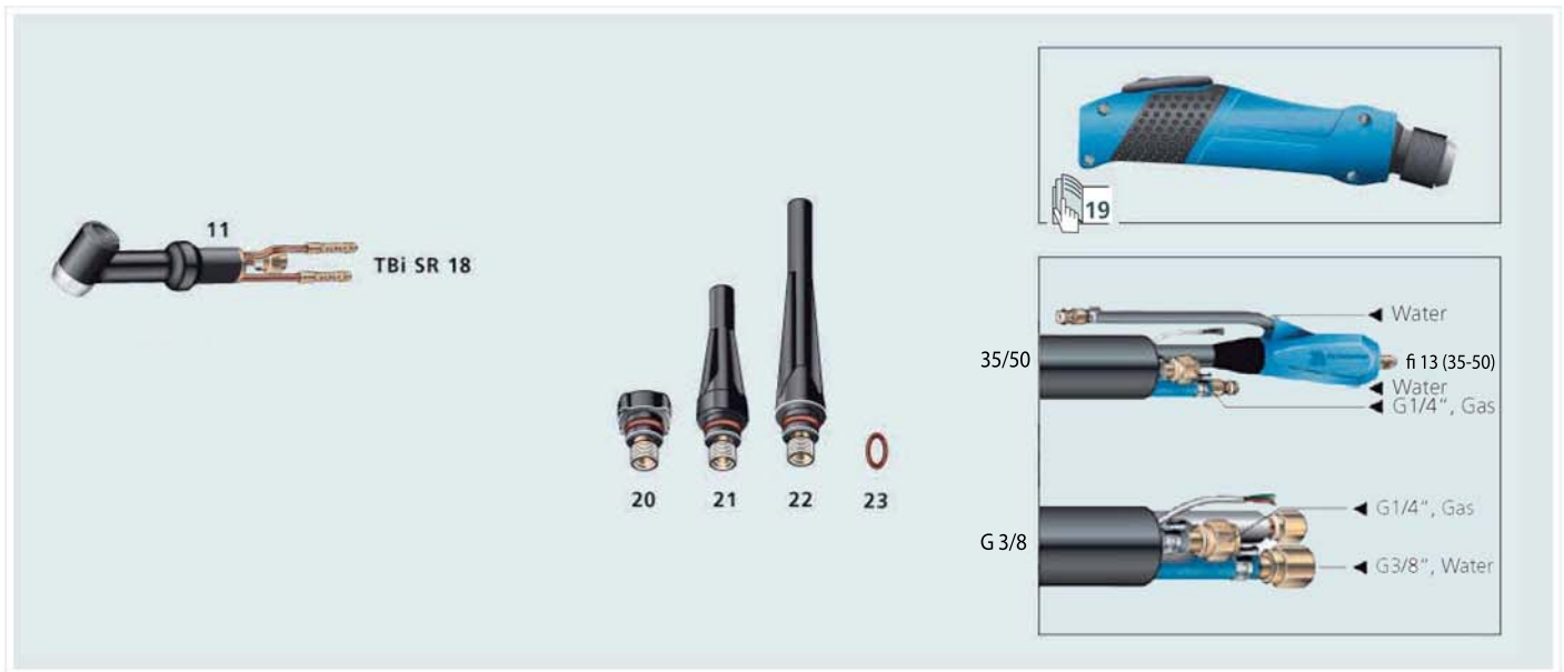
TBi SR 18

TBi SR 18 (FX) wassergekühlt / water cooled / refroidissement par eau 100% (10 min.) AC: 225 A DC: 320 A Ø 0.5-4.0 mm